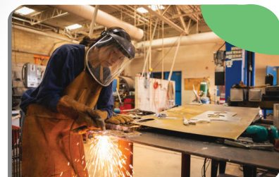
Vocational Welding Schools